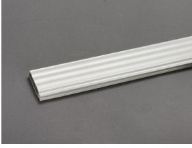
01 244 busbar cover for 12 - 30 x 5 busbar, 1m long touch protection cover